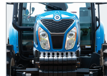
Newly designed headlamps The high-output projection lamp lights up even the darkest of nights.