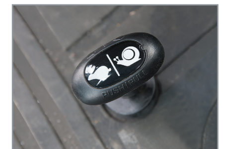
Standard creeper Ultra-slow 0.12mph operation provides increased versatility without the additional cost.