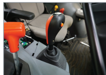
Hand clutch The hand clutch button added to the gear control lever enables you to change gears easily.