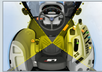
Clear view cabin The spacious cabin offers a clear 360° view of the full working width of attached implements