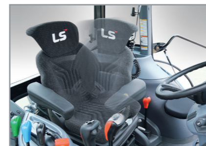
Premium seat The air suspension seat with 10 degree swivel for added comfort.