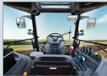
A wide field of vision The hood design combined with a large windshield and the sunroof provide a clear view with minimal obstructions.