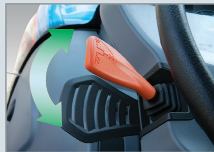
Power shuttle Easily change from forward or reverse with a simple flick of a lever without depressing the clutch pedal.